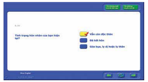
FIGURE 2 Example of ACASI from Vietnam

The question above reads: "What is your current marital status?". The possible answers are "Single/Married/Widowed, Divorced or Separated", with the additional options in the right upper corner of "I don't know how to answer/I don't want to answer".